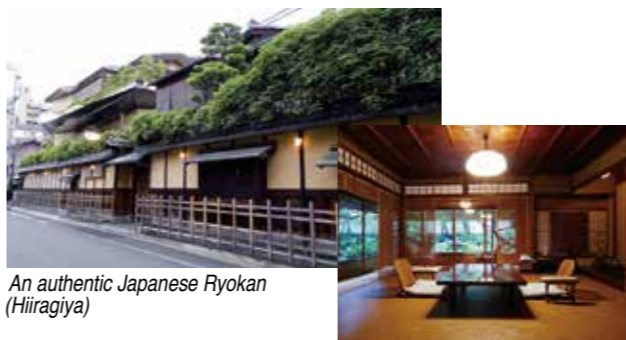
An authentic Japanese Ryokan (Hiragiya)