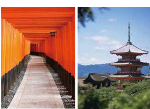
Fushimi Inari Taisha Shrine

There are tours of varying lengths of time in Kyoto itself and from Osaka or Tokyo with English speaking guides. But whichever way you choose to view the treasures of Kyoto, you will never see enough — and never be disappointed.