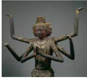
Ashura, Kofukuji Temple