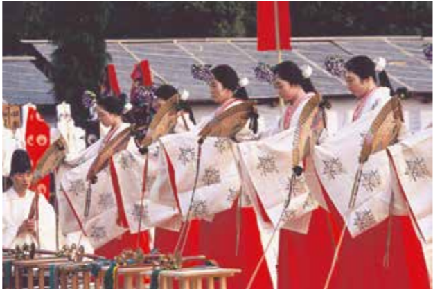
Kasuga Taisha Shrine